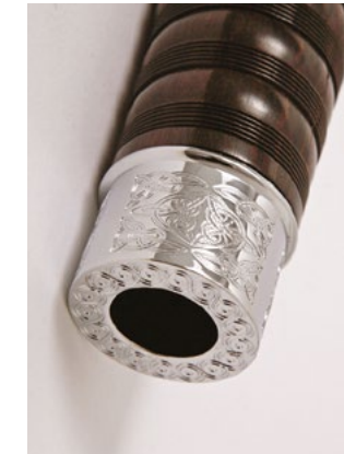
Nickel Design - Wallace Knot