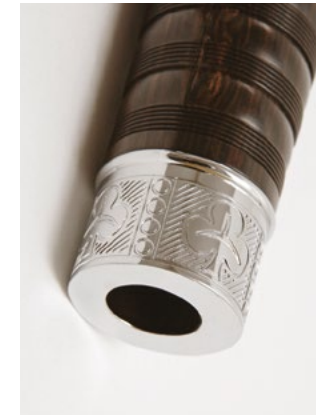
Nickel Design - Shamrock