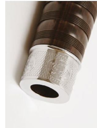
Nickel Design - Thistle