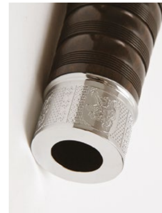
Nickel Design - Lion Rampant