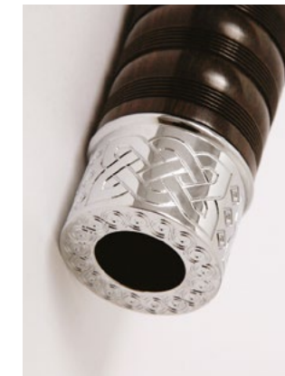
Nickel Design - Celtic