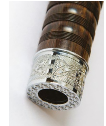
Nickel Design - Dot Knot