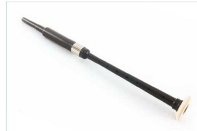
Practice Chanter With Imitation Ivory Sole & Nickel Ferrule