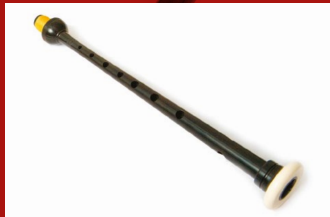
African Blackwood Pipe Chanter