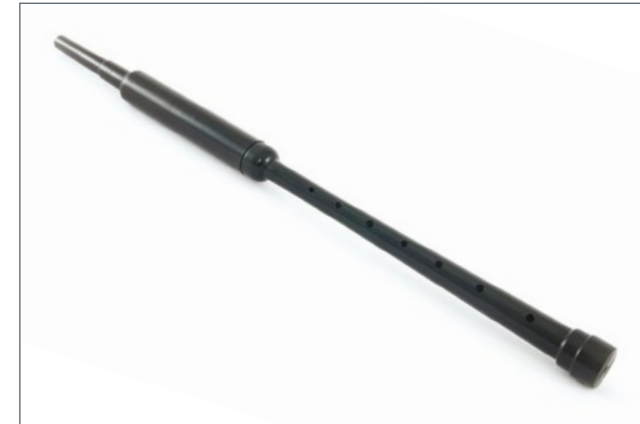
Practice Chanter Plain

Our practice chanters are available in either Plastic or African Blackwood and come in 3 different sizes - Junior, Standard & Long. Your chanter can be fitted with either a Nickel or Imitation Ivory Ferrule and Imitation Ivory Sole Place. Our Practice chanters are engraved with our Wallace Bagpipes logo and can be engraved with your band or company logo free of charge.