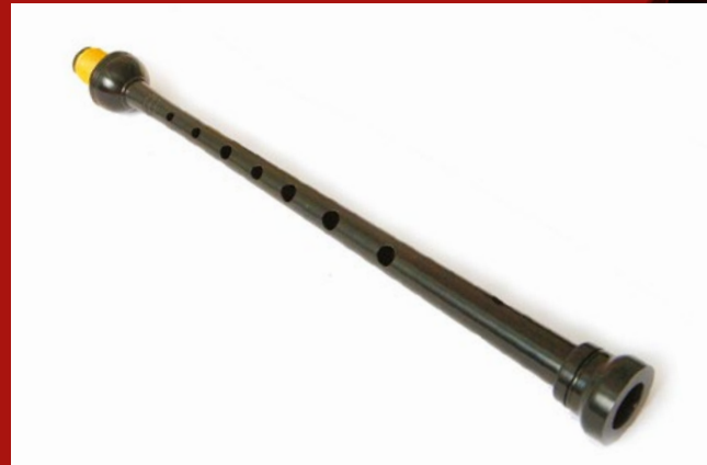
Plastic Pipe Chanter