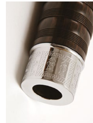
Nickel Design - Fire Dept.