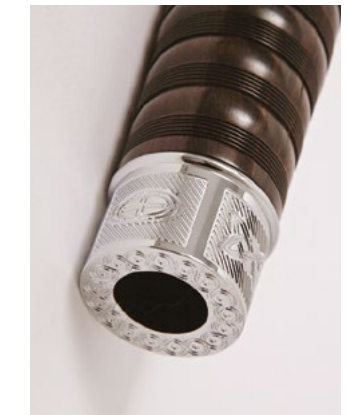
Nickel Design - Runic